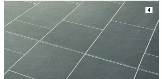
4 REMEMBER TO INSTALL PERIMETER JOINTS AND BLANKE EXPANSION JOINTS PER TCNA GUIDELINES EJ171.**