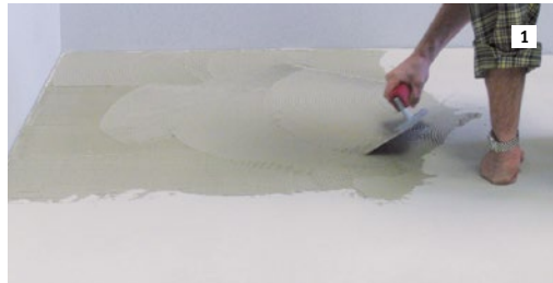
1 APPLY LOOSELY MIXED MODIFIED THINSET MORTAR TO THE SUBSTRATE USING A 3/16" V-NOTCHED TROWEL.

BLANKE SECUMAT is constructed from a fiberglass reinforcing mesh embedded between two layers of polyester fabric.