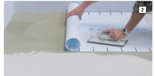
2 APPLY BLANKE SECUMAT TO THE SUBSTRATE AND EMBED MAT WITH FLOAT OR ROLLER.*